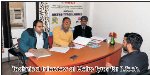
Technical Interview of Metro Tyres for B.Tech.