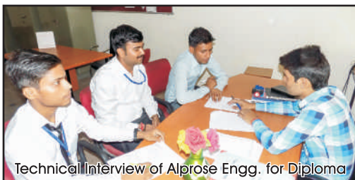
Technical Interview of Alprose Engg. for Diploma