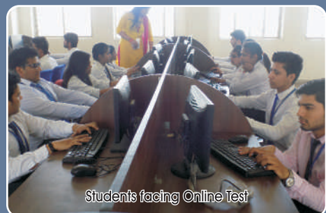
Students facing Online Test

The new concept that have been involved by the team of placement cell of our institute is assessment of students by online adaptive test. For which the institute has tied up with Aspiring Mind – A Multinational Forum, who perform 3 hours online test of our graduates and diploma level students. This test provides us the proper assessment report of individual student and suggests us for the needful training that has been required for each student.