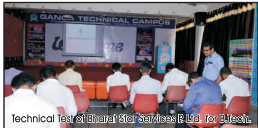
Technical Test of Bharat Star Services P. Ltd. for B.Tech.