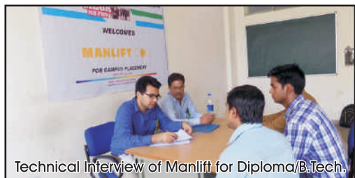
Technical Interview of Manlift for Diploma/B.Tech.