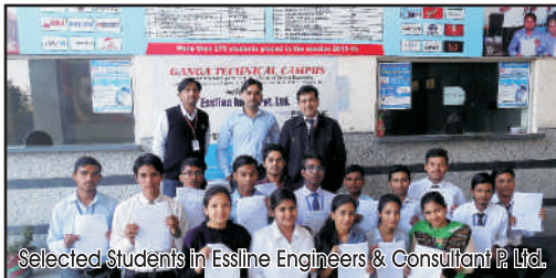
Selected Students in Essline Engineers & Consultant P. Ltd.