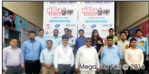
Mega Job Fair @ 2016