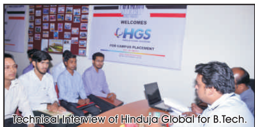
Technical Interview of Hinduja Global for B.Tech.