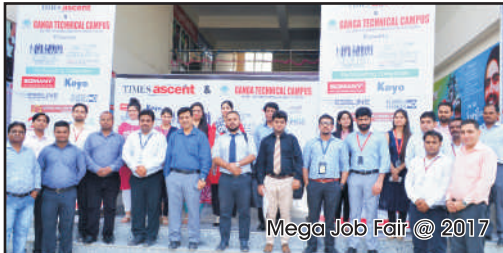
Mega Job Fair @ 2017