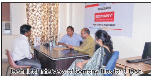
Technical Interview of Somany Tiles for B.Tech.